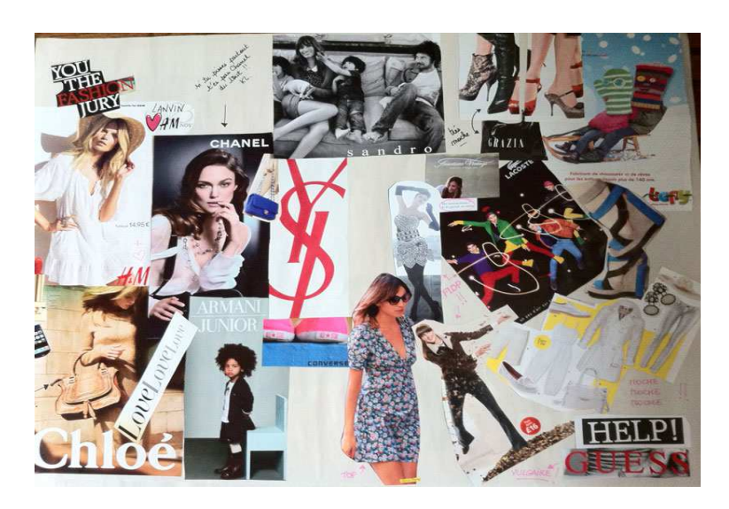
Figure 3: Collage of preferred and non-preferred apparel brands

With the classical content analysis we generate 63 items, and with the lexical analysis 92 items with a repetition above 5. By crossing those items and removing redundancy, we can identify 77 items .